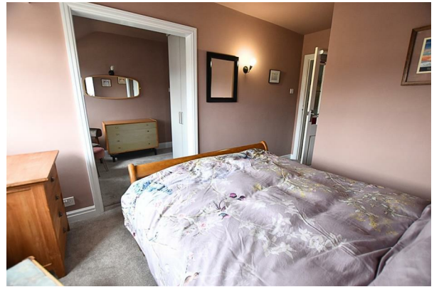
DRESSING ROOM/FOURTH BEDROOM