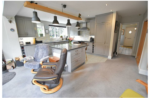
LIVING KITCHEN DINER