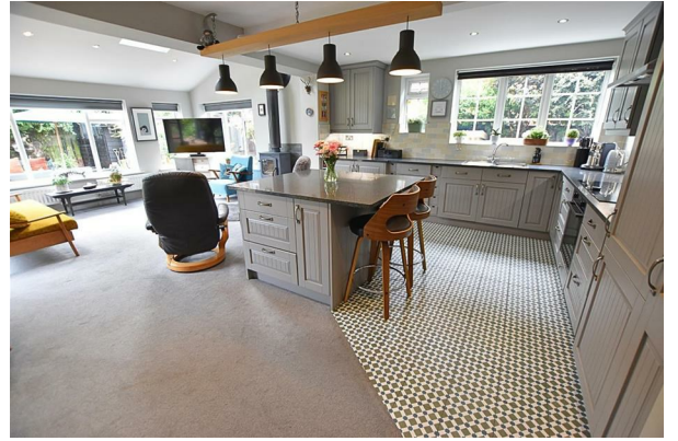
LIVING KITCHEN DINER