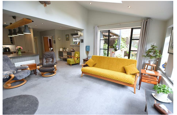
LIVING KITCHEN DINER